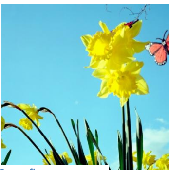
Some flowers were very elegant